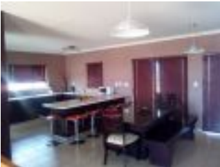
Dining area and kitchen on 1st floor