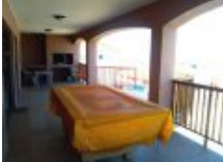
Built-in Barbeque on balcony

All 4 bedrooms and 2 bathrooms both on ground floor