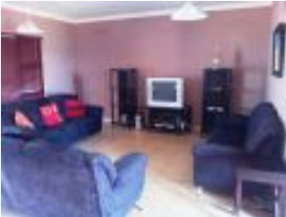
Open-plan living area on 1st floor