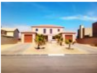
1 Street view.jpg