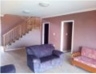
TV area on ground floor

Sunday, 11 February 2018 18:00 - Last Updated Sunday, 11 February 2018 18:25